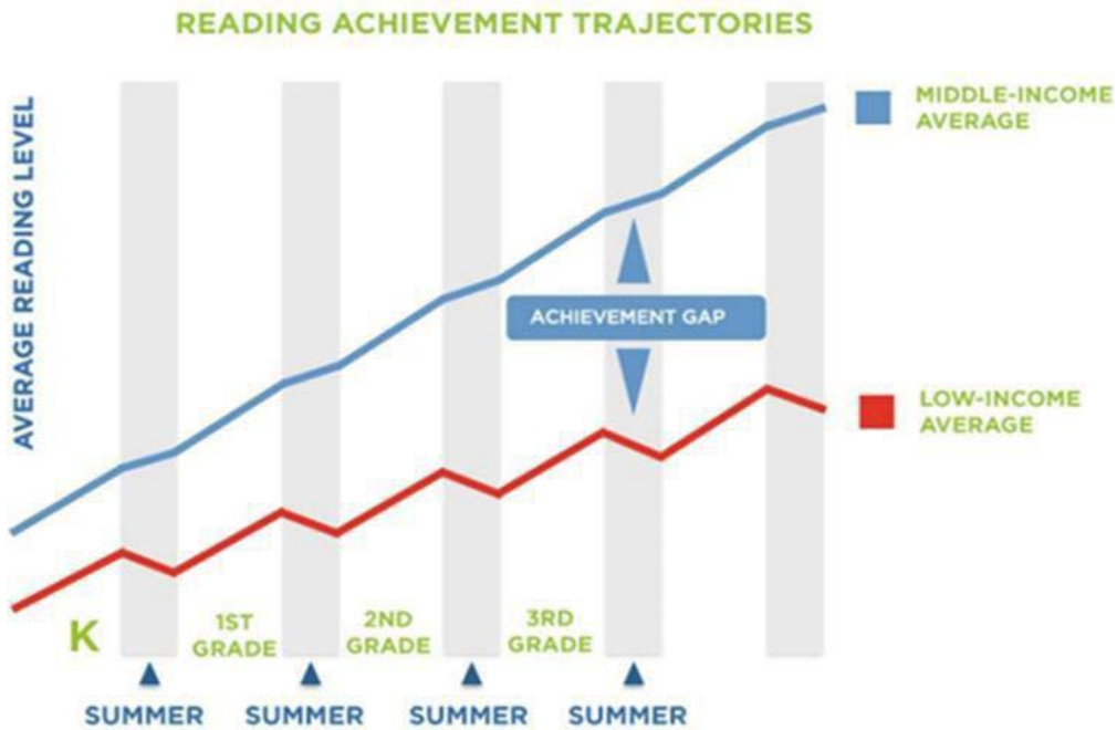
Figure 2. Reading achievement trajectories for middle- and low-income students in kindergarten through 5th grade (Expanded Learning Opportunities Council, 2017 Annual Report).

What is the problem, opportunity or priority you are addressing with the request?