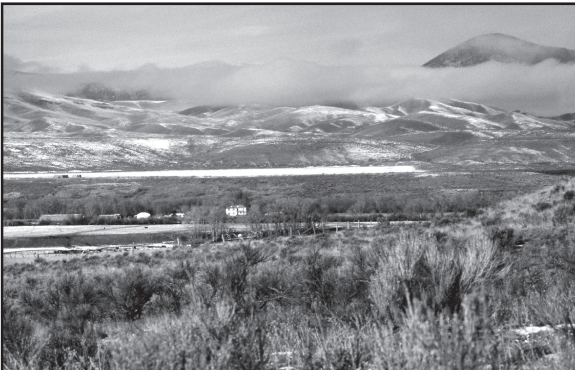
Old Lemhi Agency, near Lemhi, Idaho.