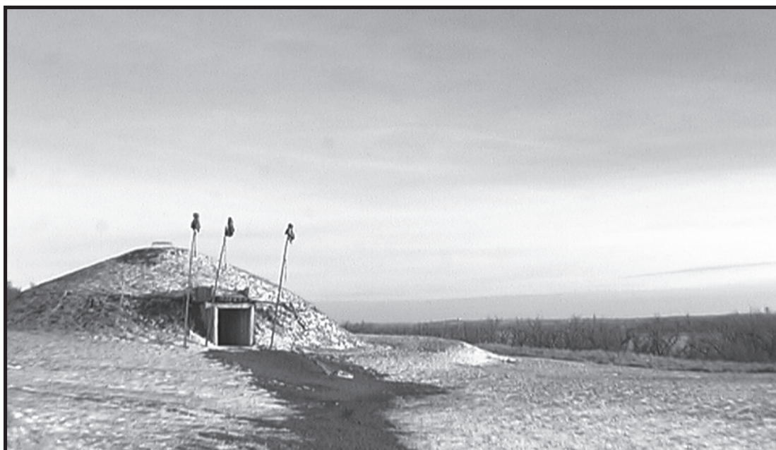
Mandan earthlodge reproduction, Ken Furrow photograph