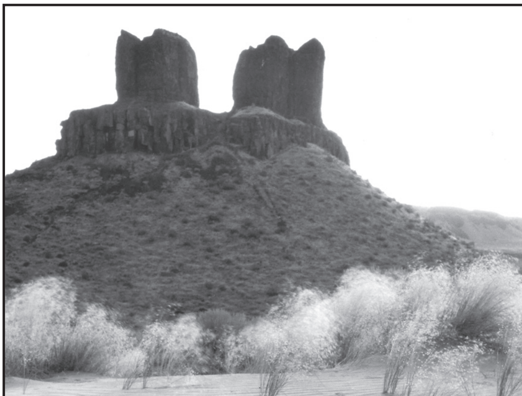
Historic photograph "Cayuse Sisters", of rock formation on Columbia, near La Grande, Oregon. n.d.