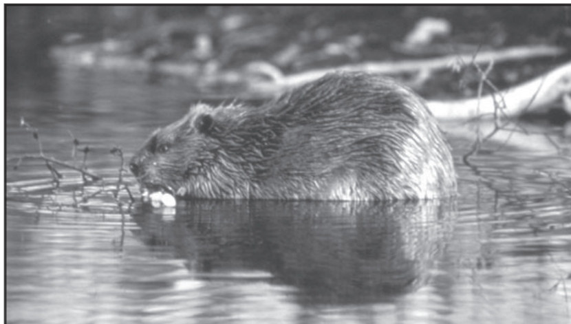
Ken Walchek photograph