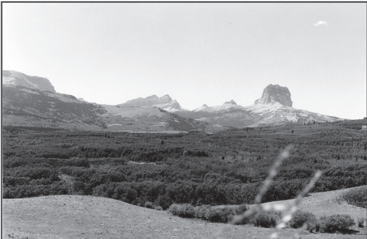
Chief Mountain