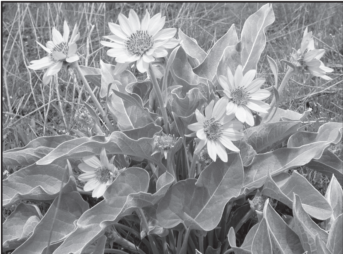
Arrow-leaf Balsamroot ( Balsamorhiza sagittata )